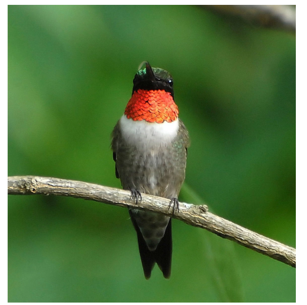
Ruby-Throated Hummingbird